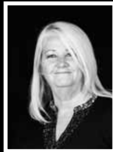
Colleen Young Props