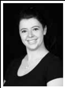
Mel Wells Audio