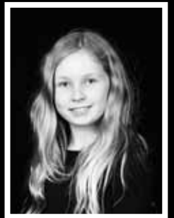
Caitlin Trainor Props